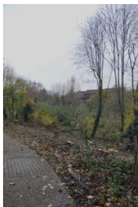
A new view into the Orchard

Come and join the Woodland Group—no skills required! They meet the 3rd Saturday of every month and carry out work in the Orchard and Woodlands of NAG.