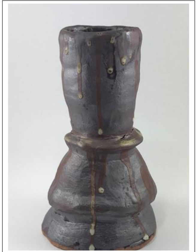
"Molten Vase" (1 st Year Student)