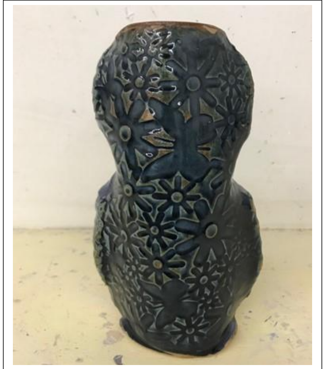
"Blue Vase" (2 nd Year Student - 2020)