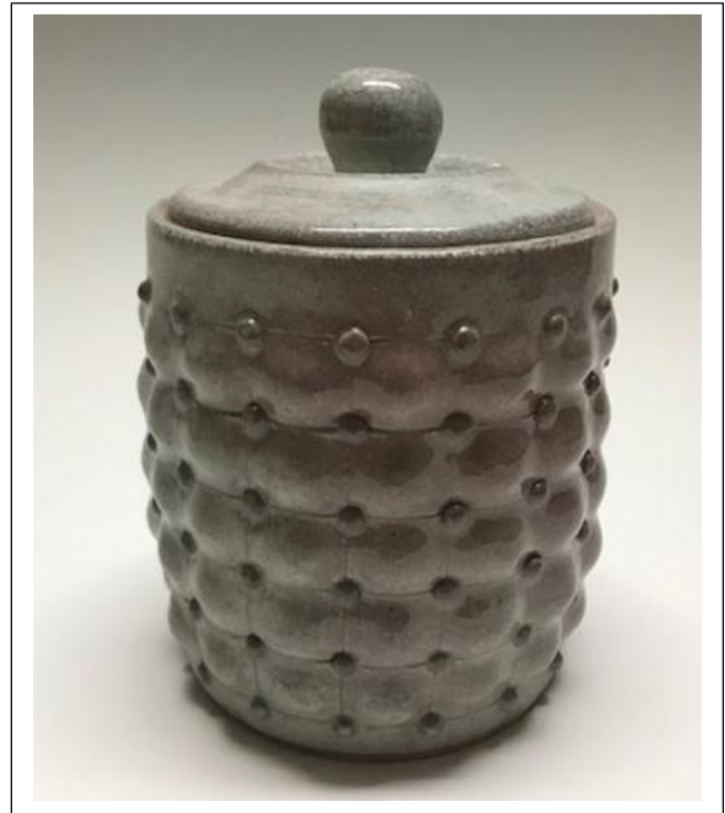
"Pillow Jar" (4 th Year Student - 2019)