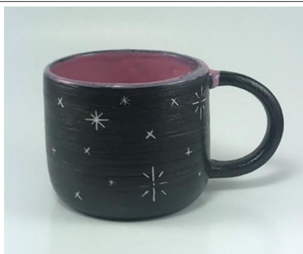
"Starlight Cup" (3 rd Year Student - 2019)