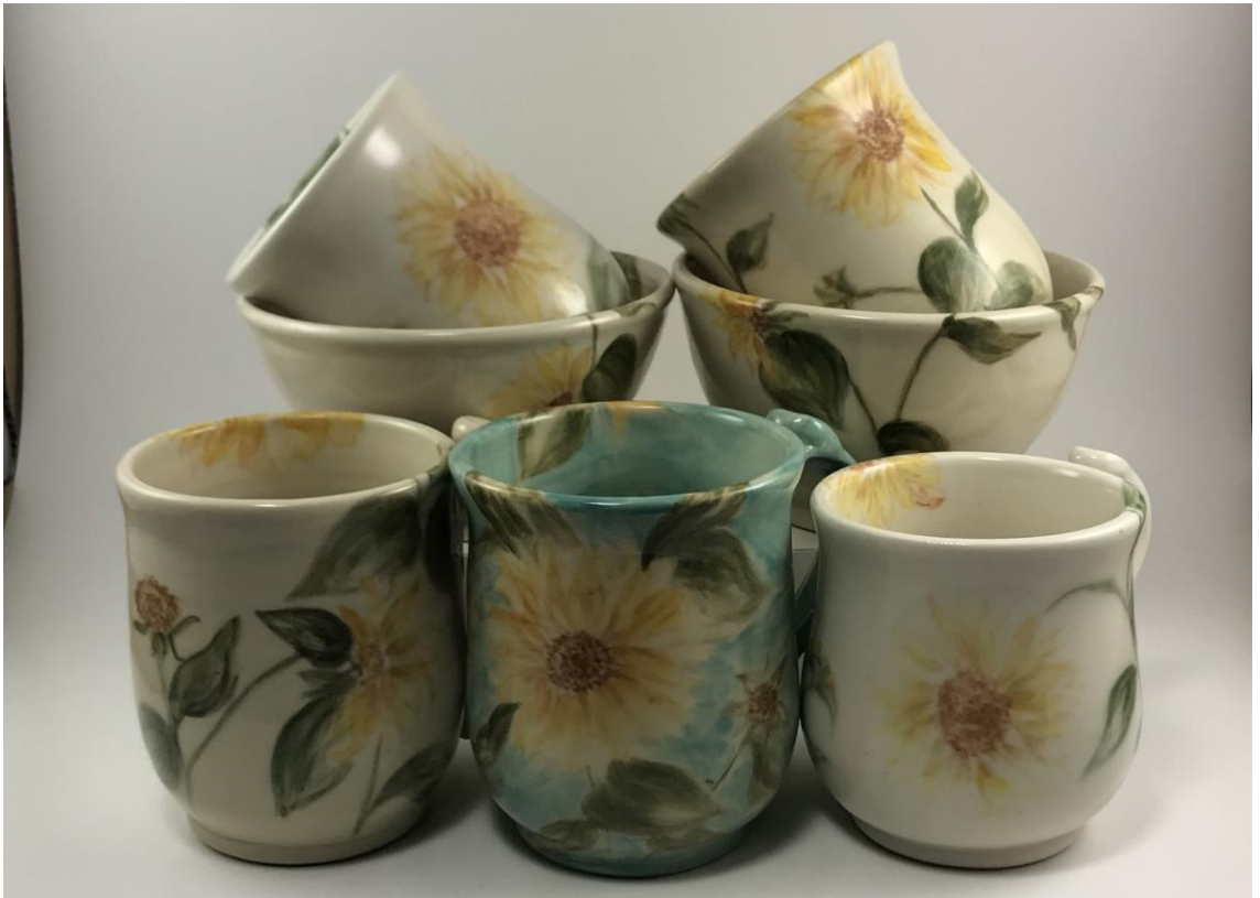
"Flower Set" (1 st Year Student - 2020)