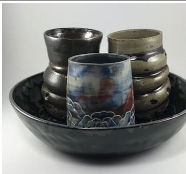
"Tumblers in a Bowl" (3 rd Year Student - 2019)