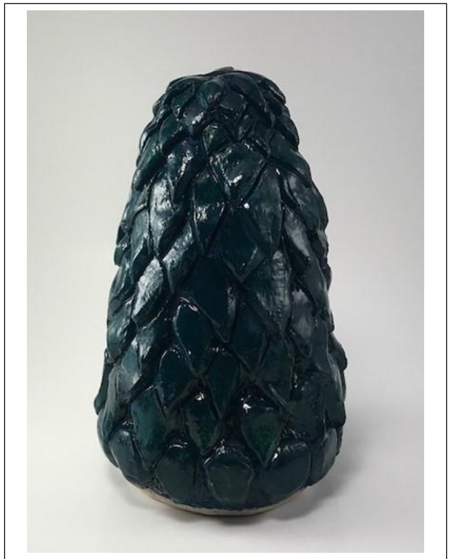
"Shrub" (1 st Year Sculpture Student - 2019)