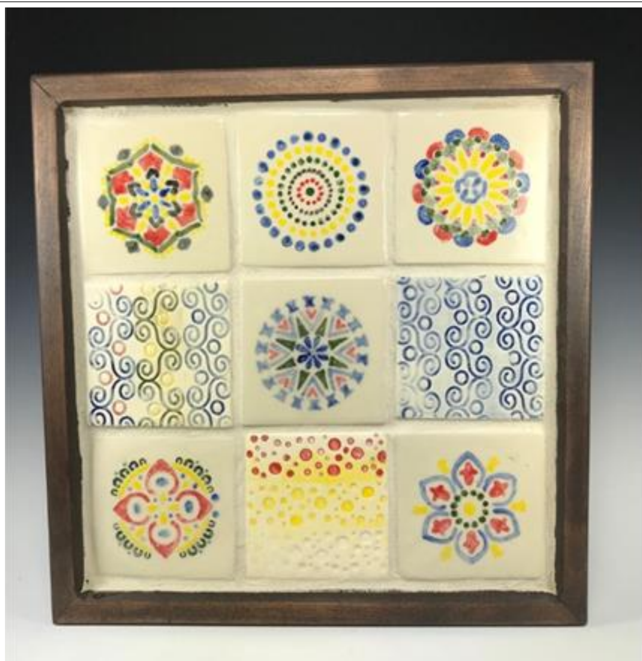
"Tiles" (1 st Year Student - 2019)