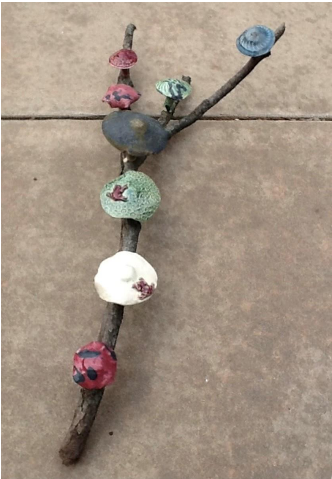
"Shrooms" (4 th Year Student - 2018)