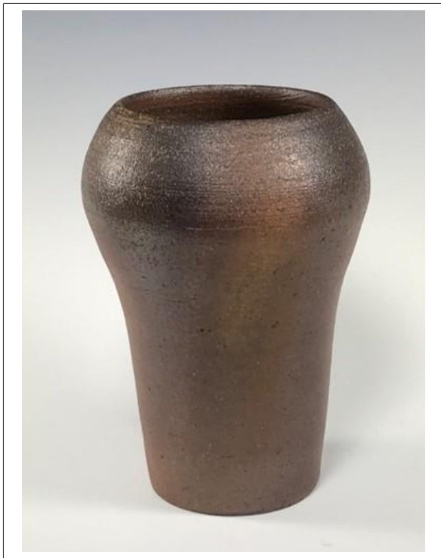
"Vase" (5 th Year Student - 2020)