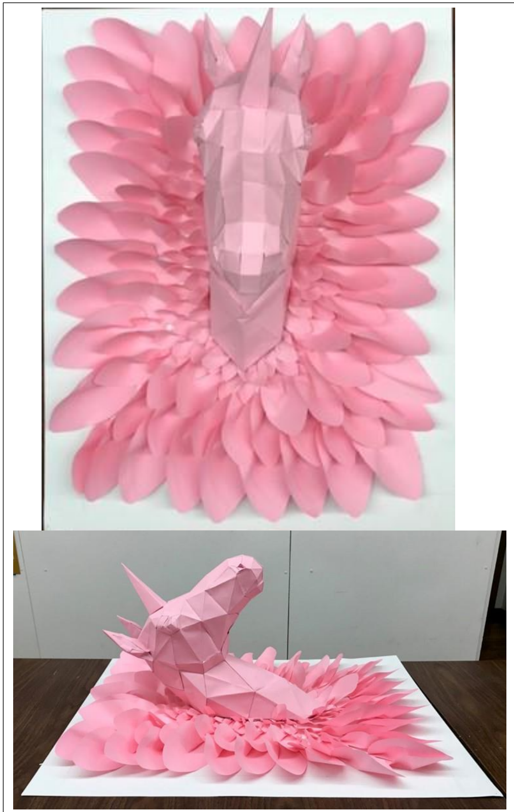
"Horse Petals" (1 st 3D Design Year Student - 2019)