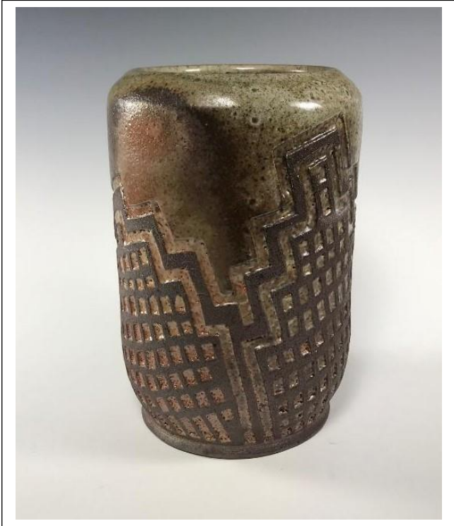
"City" (4 th Year Student - 2020)