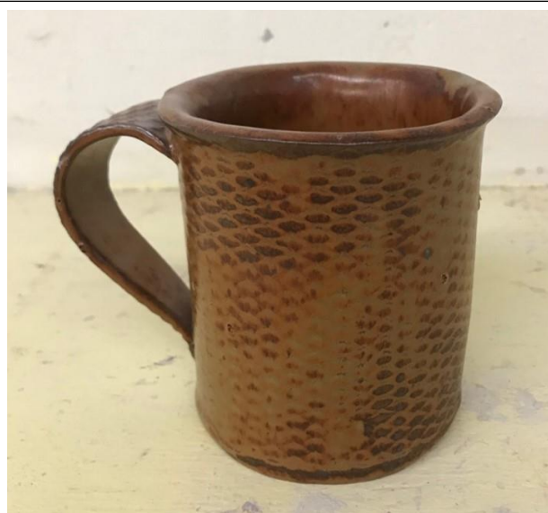
"Snakeskin Cup!" (4 th Year Student - 2019)