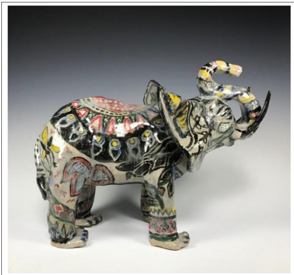
"Elephant" (2 nd Year Sculpture Student - 2020)