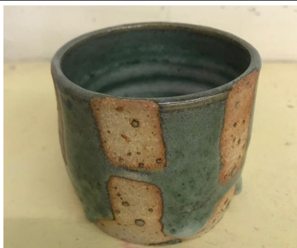
"Chawan" (3 rd Year Student - 2019)