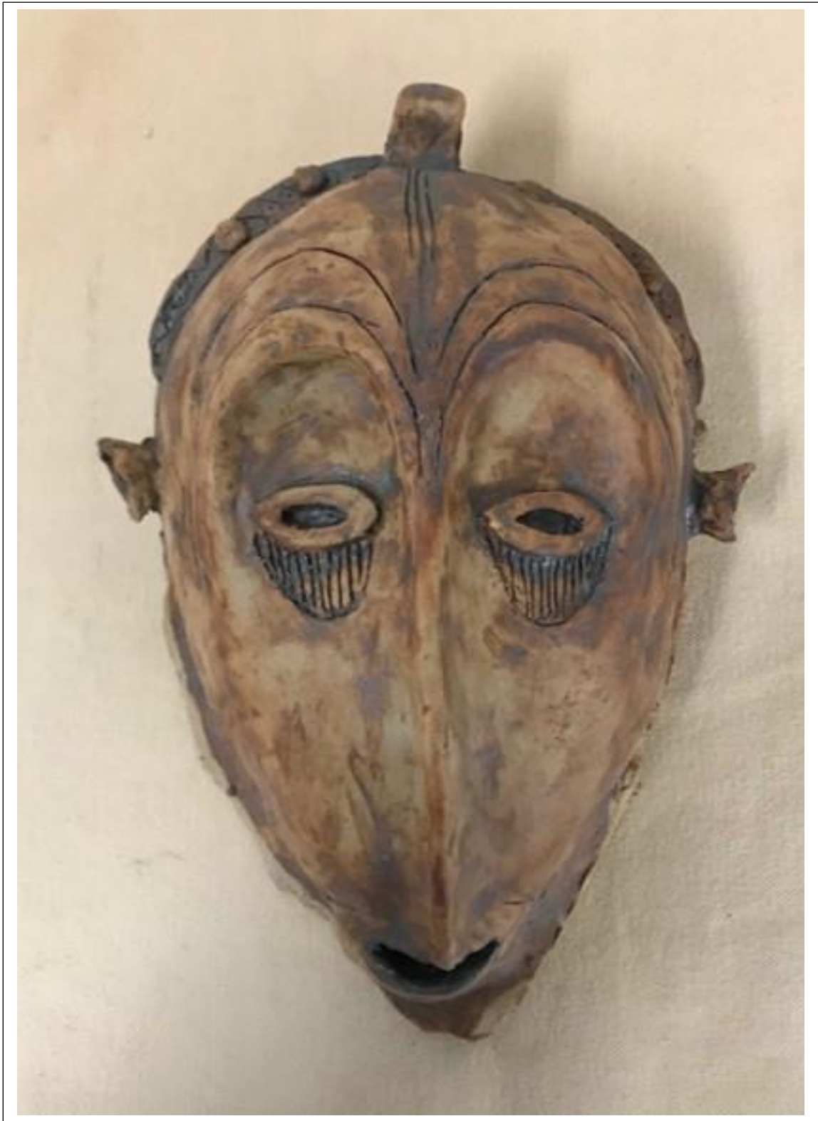
"Mask" (4 th Year Student - 2018)