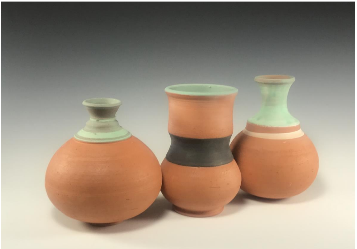
"Flower Set" (4 th Year Student - 2020)