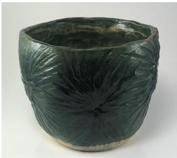
"Carved Cup" (1 st Year Student - 2019)