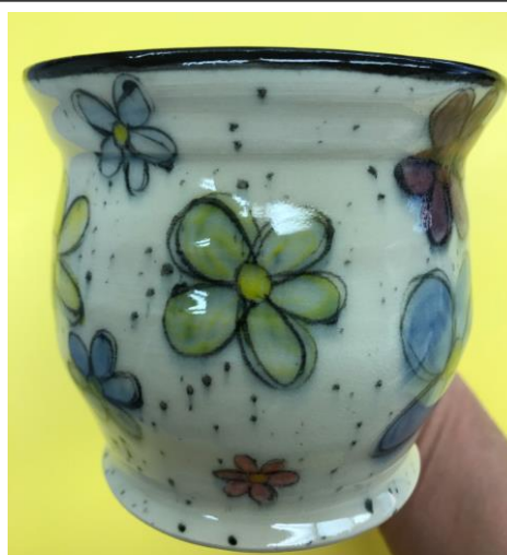
"Flower Mug" (3 rd Year Student - 2019)