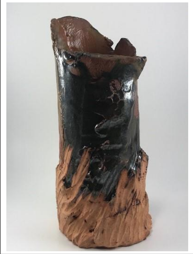
"Thrown & Sculpted" (1 st Year Student - 2019)