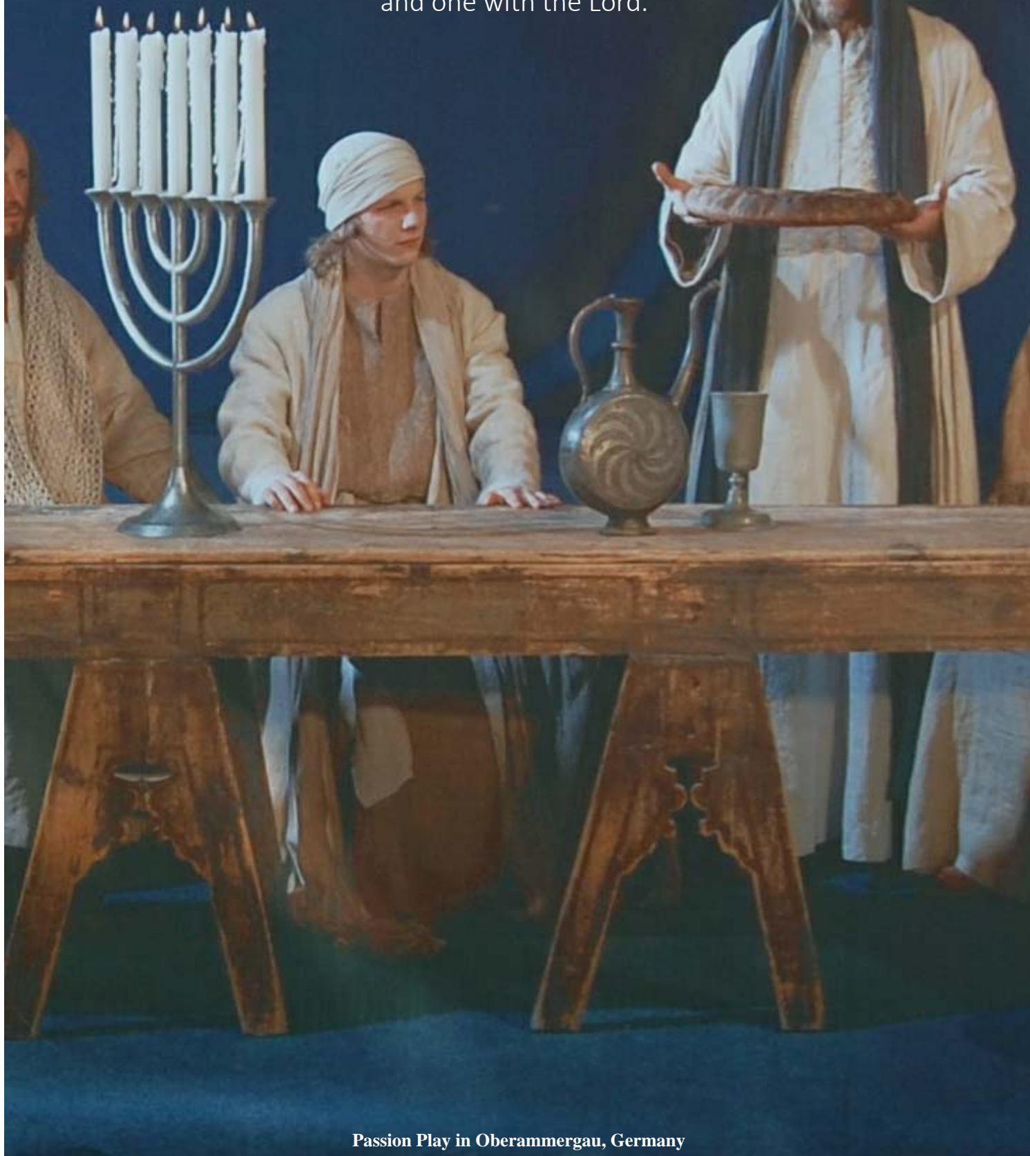
Passion Play in Oberammergau, Germany

We celebrate today the Source and Summit of our lives: the Most Holy Body and Blood of Jesus Christ. Partaking of the Eucharist, we indeed become one with each other and one with the Lord.